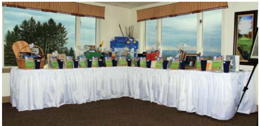
Over 20 amazing auction items were generously donated and displayed for the golfers and painters to win!

W e are excited to announce that the 3rd Annual Charity Golf Outing and Paint-n-Sip recently held at the Ligonier Country Club raised $21,000 for the Greater Latrobe Partners in Education Foundation (GLPIEF). Thank you to all who supported the events! The funds raised will be used specifically for students with special needs in the Latrobe School District and the autistic support, learning support and life skills classrooms.