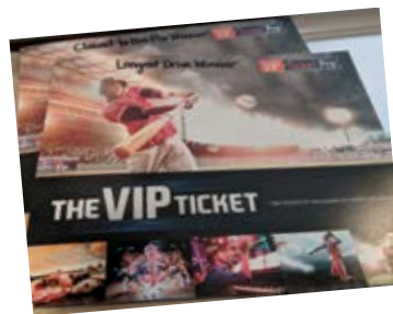
Additional prizes included Pirate and Steeler tickets, a million dollar shoot out for the winning twosome, several hole in one contests and tickets to a major sporting event of the winner's choice.